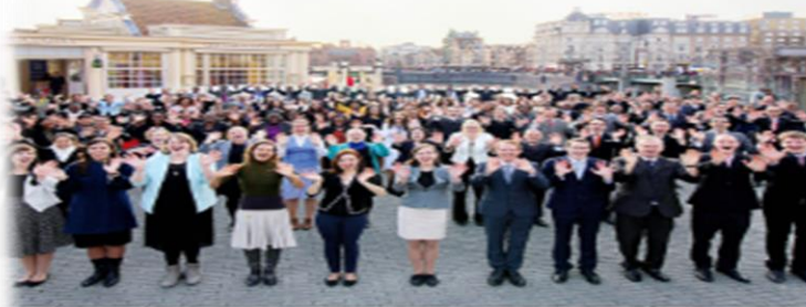
The gospel of the new covenant changes Europe Europe