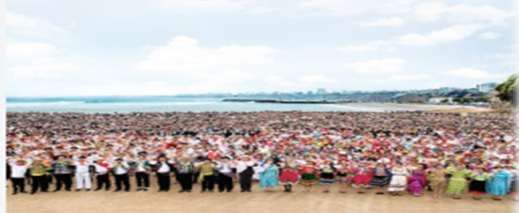
Plant fervor for the gospel and harmony South America