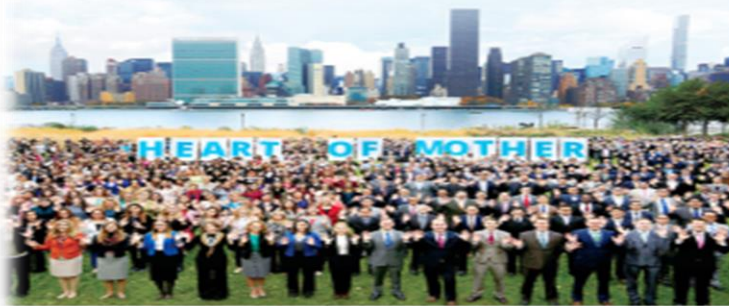
Where the world mission began North America