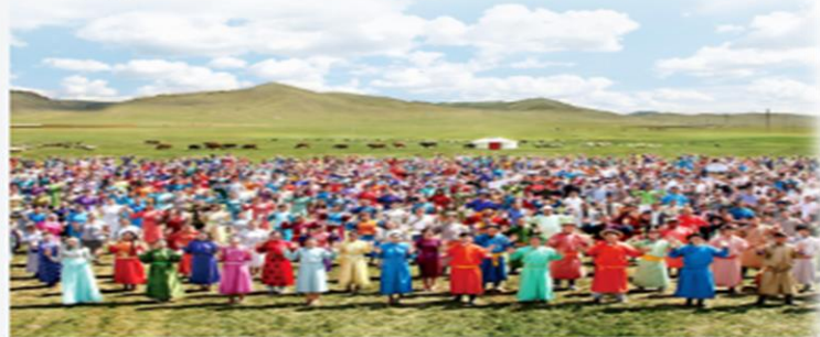
The love of God reaches the Himalayas Asia