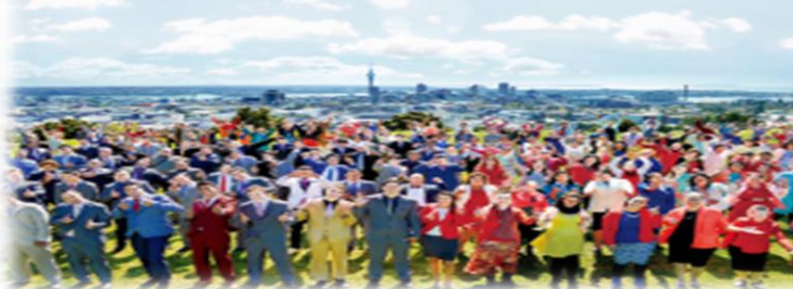
Heavenly Mother's gift to the South Pacific Ocean Oceania